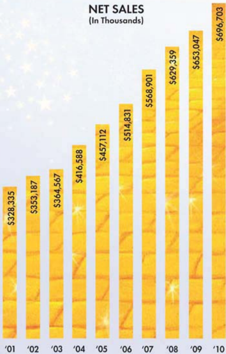
NET SALES (In Thousands)