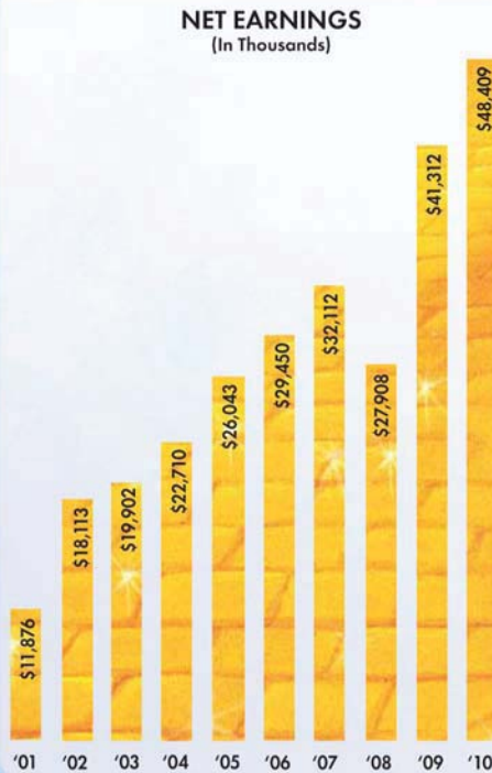
NET EARNINGS (In Thousands)